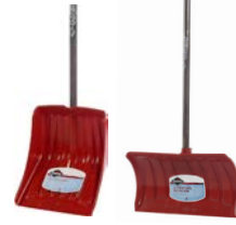
GARNP139KD GARNPP21KD GARNPP26KD